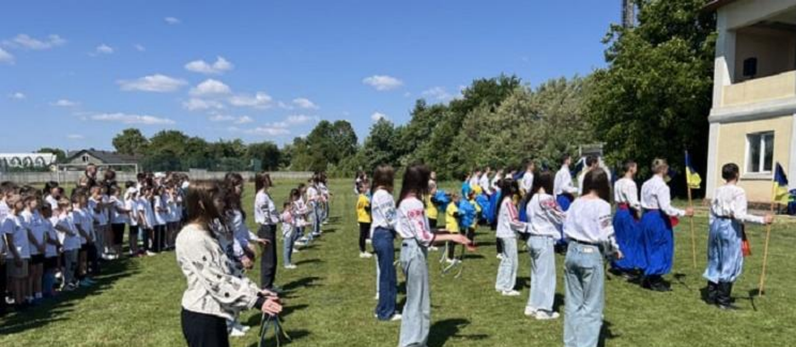
Top: Ukrainian folk dance at the Youth Hub in Volyn oblast.