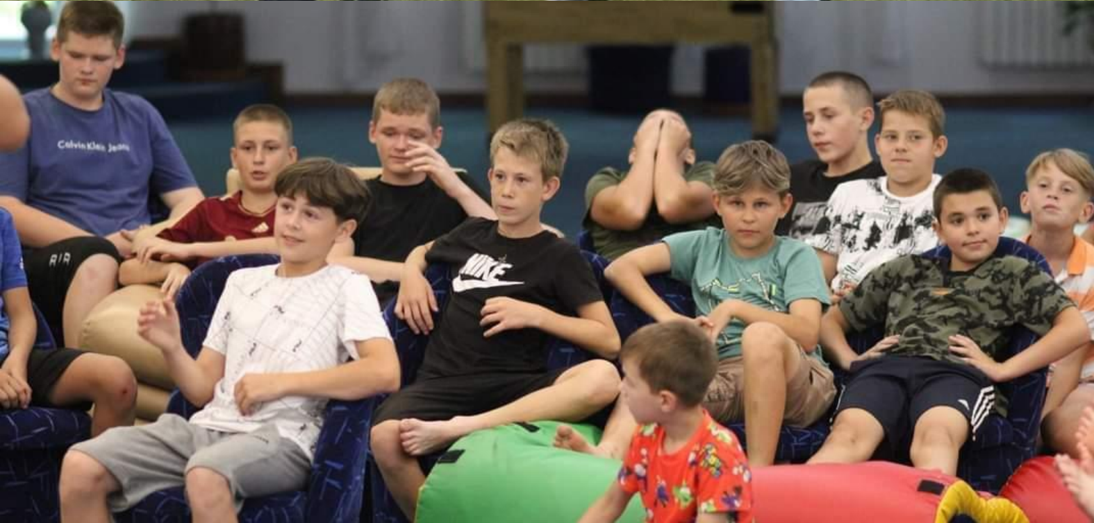
Bottom: Peer-to-peer dialogue on how to manage anxiety and anger at the Youth Hub in Kyiv oblast.