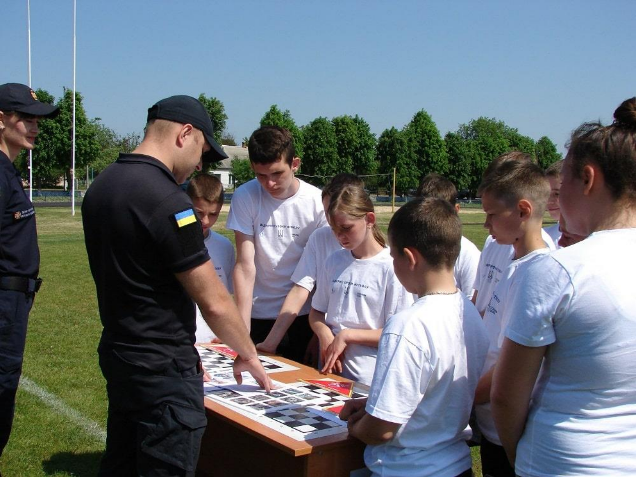
State Emergency Service personnel teaching war-time safety precautions during a Fun Football Festival in Chernivtsi oblast