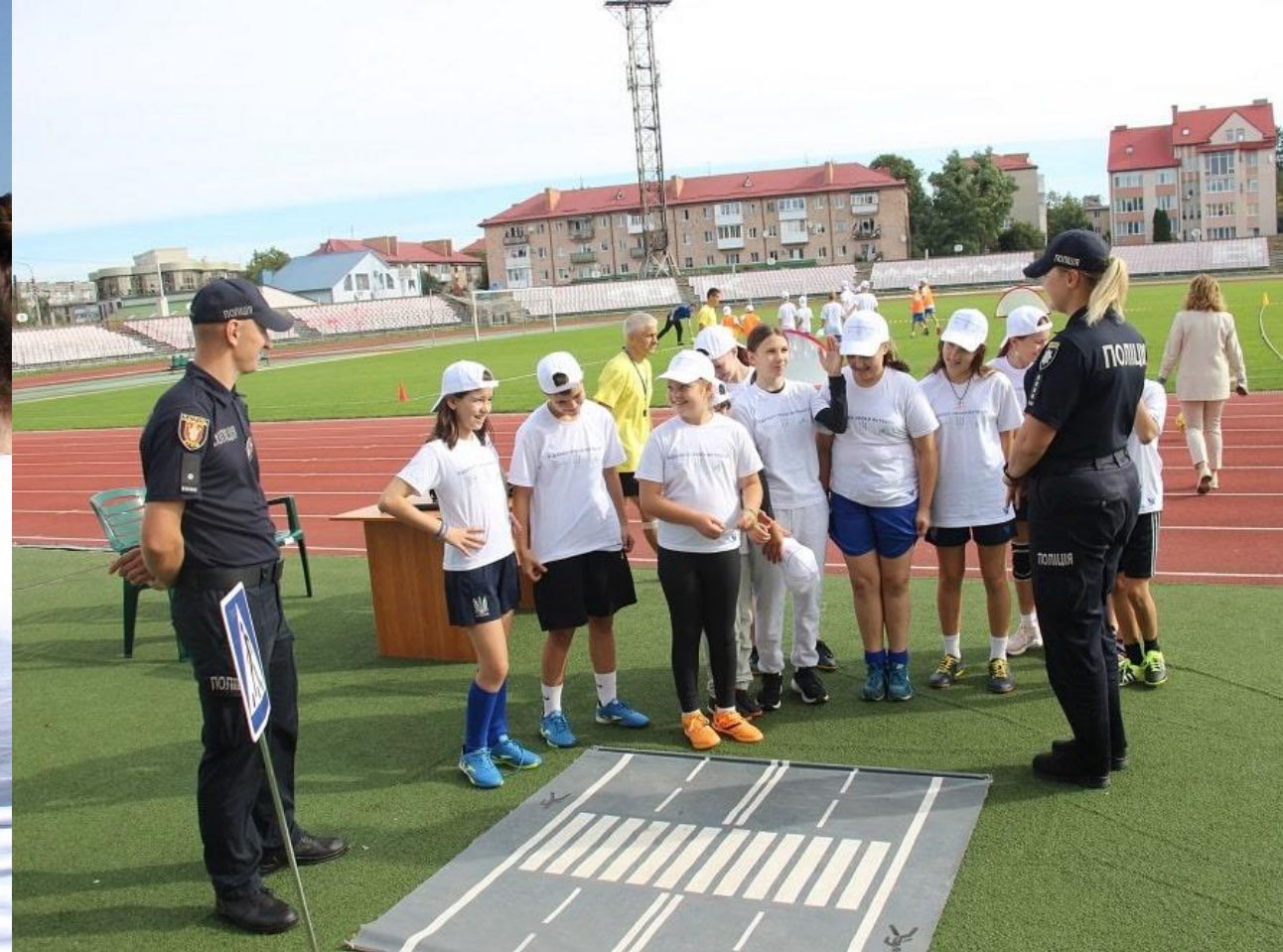
State Emergency Service personnel teaching traffic safety during a Fun Football Festival in Ternopil oblast