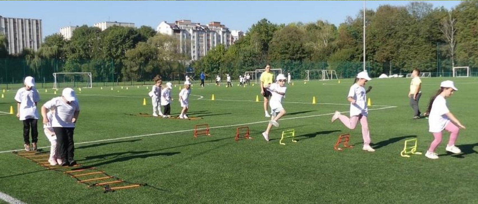
Weekly Fun Football in Ivano-Frankivsk oblast.