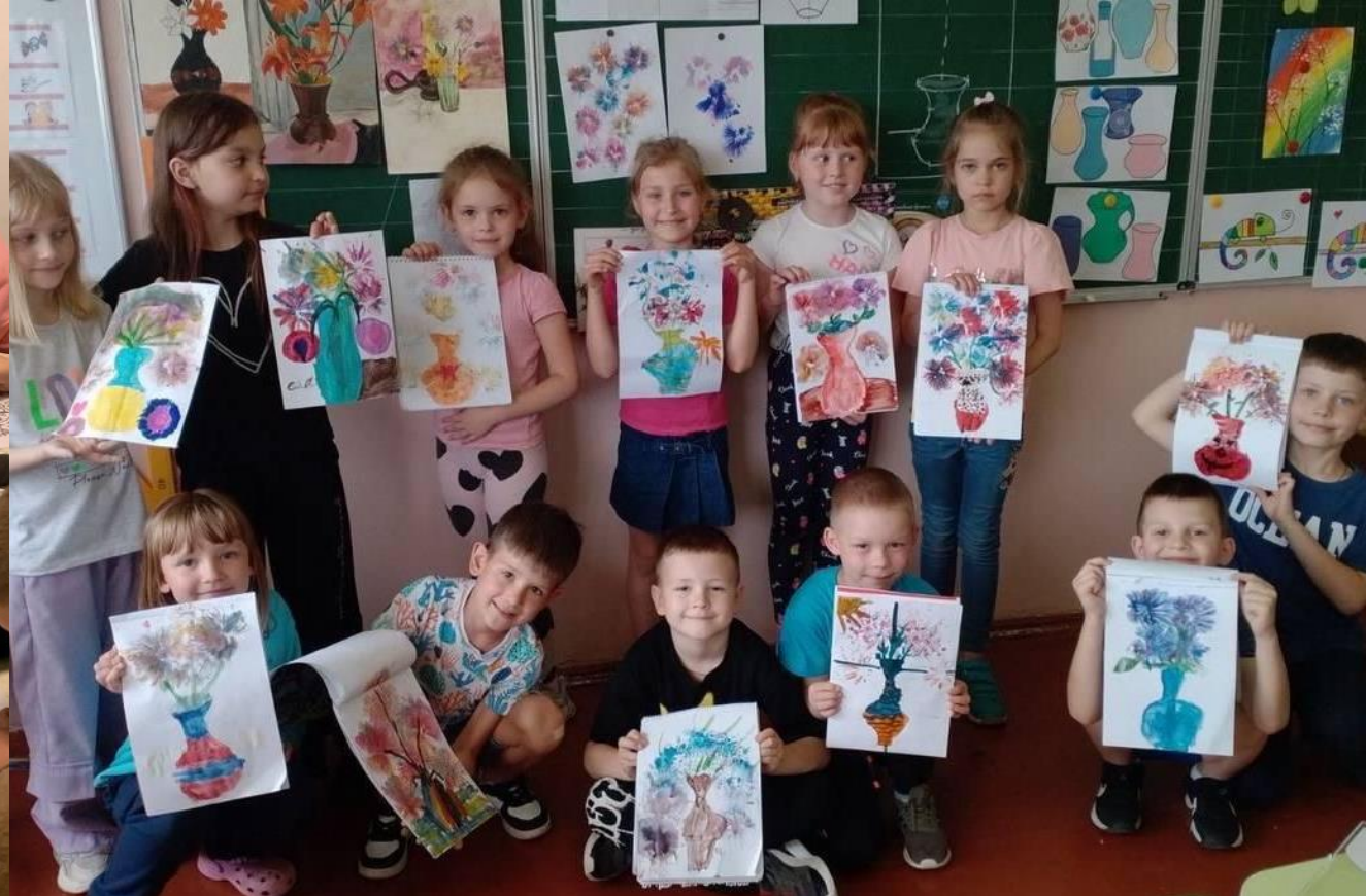
Drawing classes with youth leaders at the Youth Hub in Ternopil oblast.