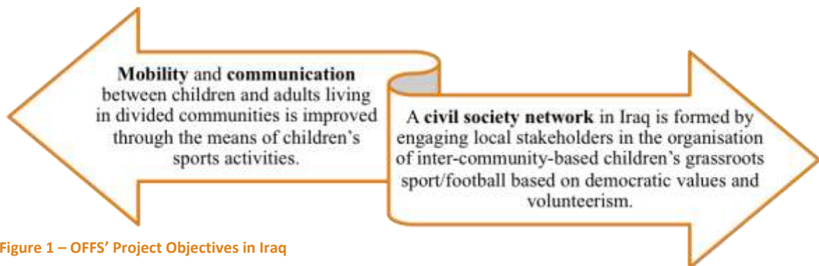
Figure 1 – OFFS' Project Objectives in Iraq

This should be done, by trying to reach the following two project objectives :