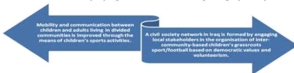
Figure 3 – OFFS' Project Objectives in Iraq

This should be done, by trying to reach the following two project objectives: